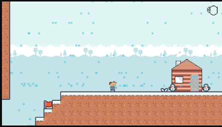
Snow Level Minigame